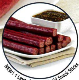
NEW! 1 Layer Sweet Teriyaki Snack Sticks

2306 / $13 12 oz. Summer Sausage Select cuts blended for a convenient snack you'll be pleased to serve. Hickory smoked! GF 2305 / $25 3 lb. Summer Sausage Enough for a game-day crowd; an appreciated, "usable" gift for employees or customers. GF 2307 / $21 Snack Sticks - 2 Layers 24 Tasty treats. Quick and easy. A favorite with the youngsters. Net 22 oz. GF