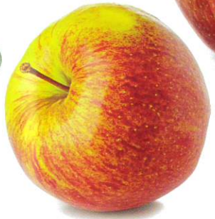
Braeburn: This apple's rich, sweet-tart flavor is high impact.